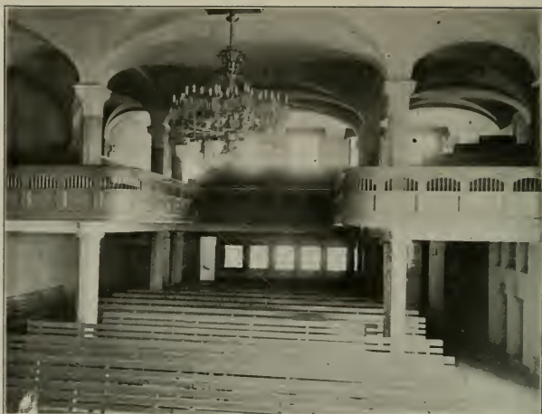
INTERIOR STOCKHOLM MISSION HOUSE, LOOKING TOWARDS THE GALLERY.